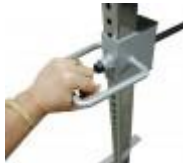
Detail of handle and high positioner