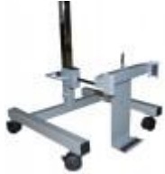
Detail of bilateral clamp and low reach of cassette holder.